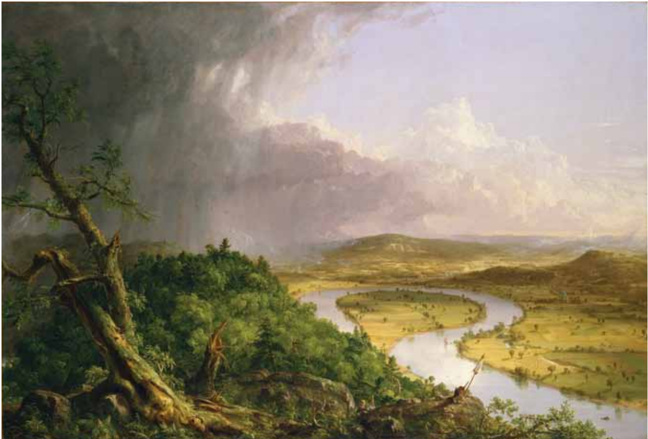
The Connecticut River as depicted in Thomas Cole's painting The Oxbow, which was loaned to Mount Holyoke College in 2002 for the exhibition, Changing Prospects: The View from Mount Holyoke.

Five Colleges and the Five College Architectural Studies Program have begun the Riverscaping project, aimed at helping communities along the Connecticut River from Turners Falls to Springfield find creative, sustainable approaches to working with and on the river. The effort is getting help from a surprising source—Europe. In December, the project was awarded a €100,000 ($135,000) grant from the European Union Delegation to the United States as part of a broader EU effort to improve Americans' understanding of Europe. Critical to Riverscaping, therefore, is the project's partnership with river experts in Hamburg, Germany—the European Green Capital of 2011—who will exchange ideas and expertise with Five College faculty members, students, and community members from throughout the Pioneer Valley.