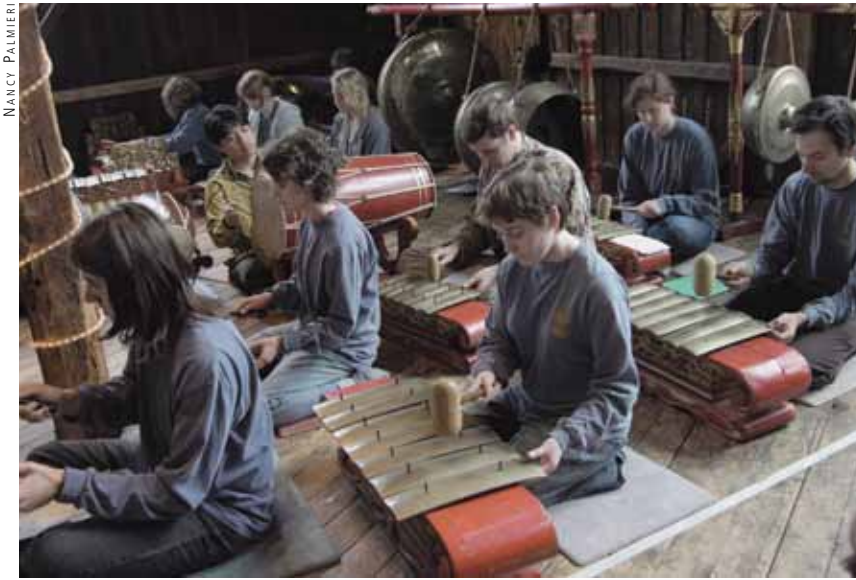
The 18-member Smith College Gamelan Ensemble, performing in the 2006 Five College World Music Festival, which was sponsored by the Five College ethnomusicologists.