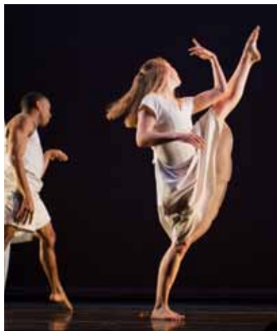
Five College dance students perform in “Gloria” at Northampton’s Academy of Music Theatre.