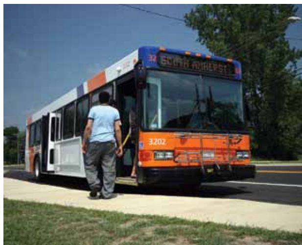
Five College bus.

The Five College transportation system is one of the largest free, private bus systems in the country and has received national recognition for sustainability. The extensive five-campus transit system, most of which is