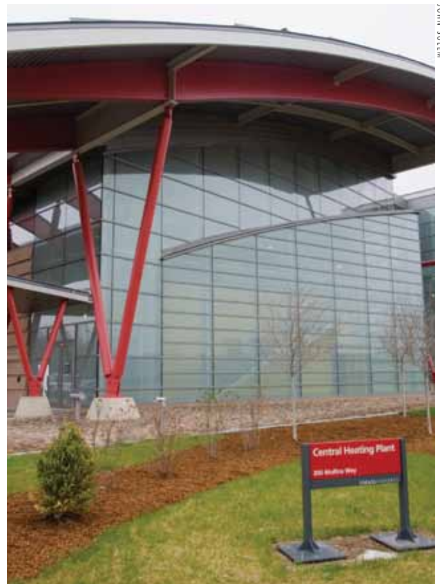
UMass Amherst's cogeneration plant.

Smith College's cogeneration plant went online in October 2008, replacing 60-year-old steam boilers. The heart of the system is a 3.5-megawatt natural gas-fired turbine that will eventually generate about two-thirds of the college's total electrical power. It is estimated that when the system is at full operation, it will cut energy costs by approximately $650,000