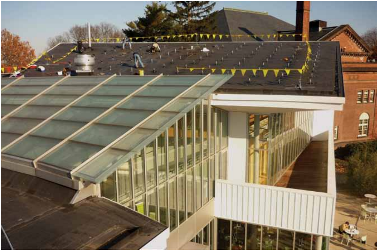
Workers begin the installation of photovoltaic panels on Smith College's Campus Center.