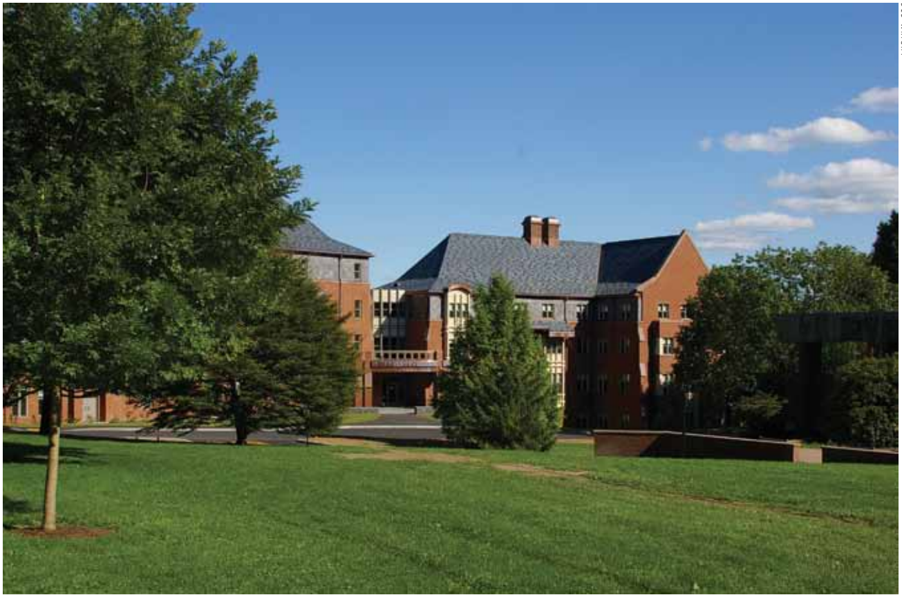
New green dorm at Mount Holyoke College.

said Todd Holland, Five College energy manager. The showerheads specified for the building use 40 percent less water than the maximum allowed by Massachusetts' energy code. "These actually save as much hot water as the solar panels make! Water use is reduced 500,000 gallons a year, enough to fill the swimming pool," according to Holland. The showerheads have proved so popular that they've been installed in all the dorms at Amherst and Smith colleges.