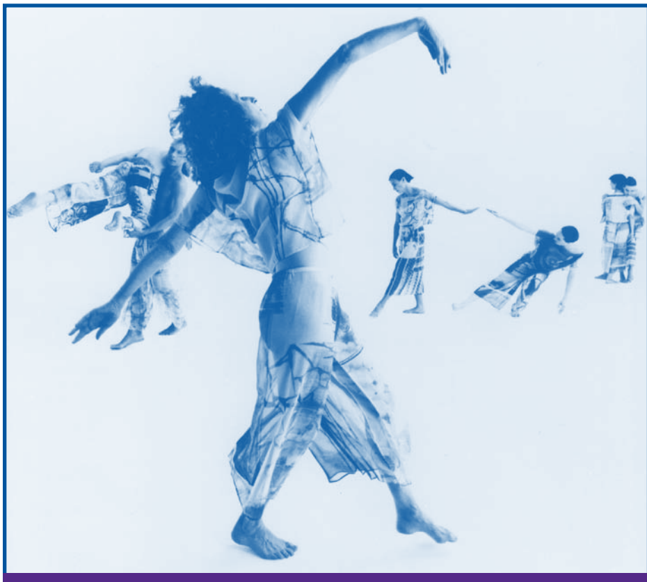
Set and Reset/Reset by Trisha Brown.

Since her early years with the Judson Dance Theater, Brown has been captivated by the infinite ways movements can be manipulated and the possibilities for developing structure and form. Her process of creating structure is evident in her description of Set and Reset as based on a rectangular dance circumventing the peripheral edge of the stage space. Brown says, "I think of it as a delivery system for other smaller units of dance—duets and trios that are issued up into the center of the stage. In the building process I gave the dancers a set of