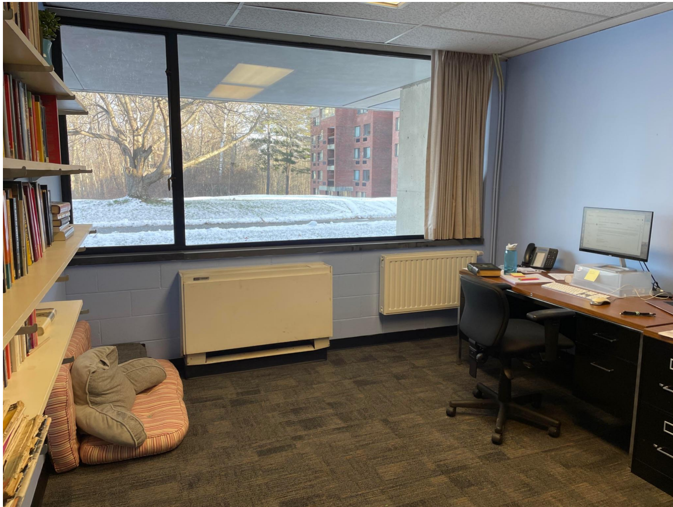
Research Associate office