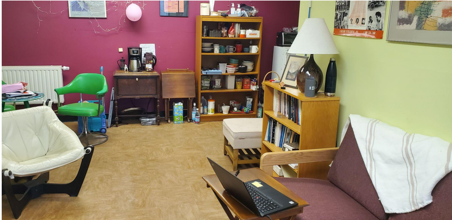
The Center's co-working space, with seating area, coffee and tea station, and small library