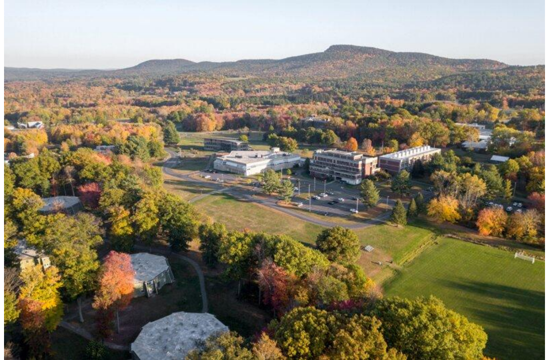
Hampshire College – spacious and abundant in natural beauty