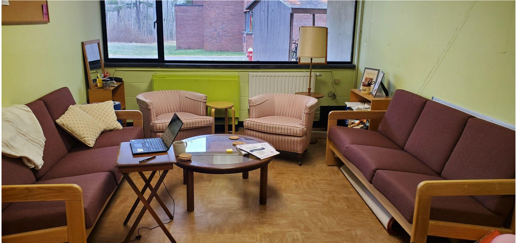
The Center's co-working space, with seating area, coffee and tea station, and small library