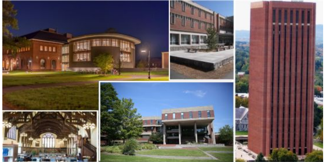
Libraries across the Five Colleges