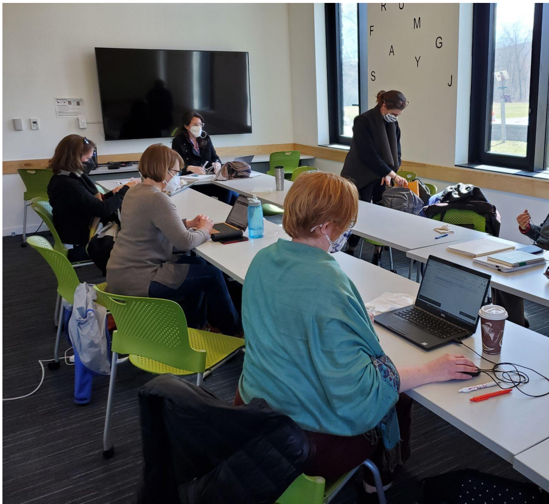
Pictured: Members of Five College feminist community co-working during a Monday Write Together session