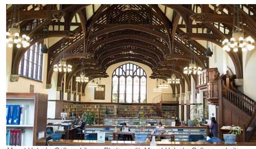
Mount Holyoke College Library.