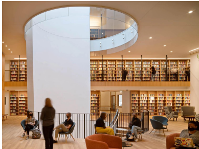
Smith College Neilson Library.