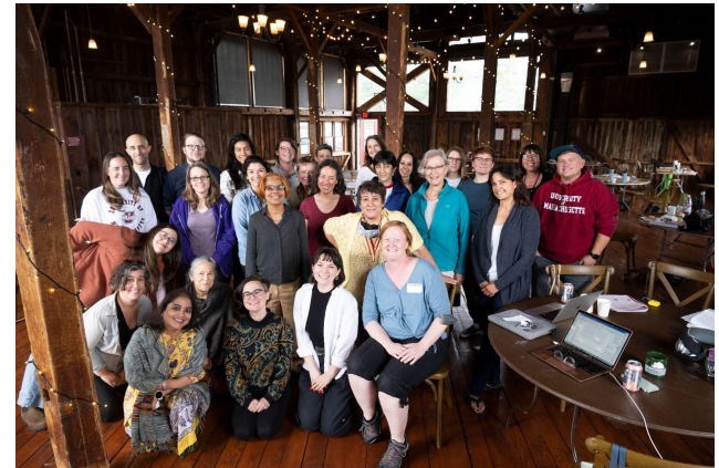
Group picture from our annual "Kick-Off-the-Summer" writing retreat.