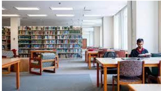
UMass Amherst Library.