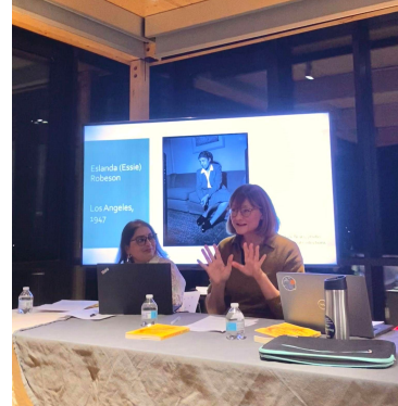
Book salon with Five College discussants

Friday: No definitive program; open workshop and excursion slots