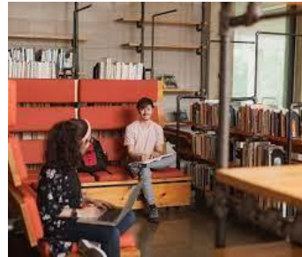
Hampshire College Harold F. Johnson Library Robert Sydel Reading Room.