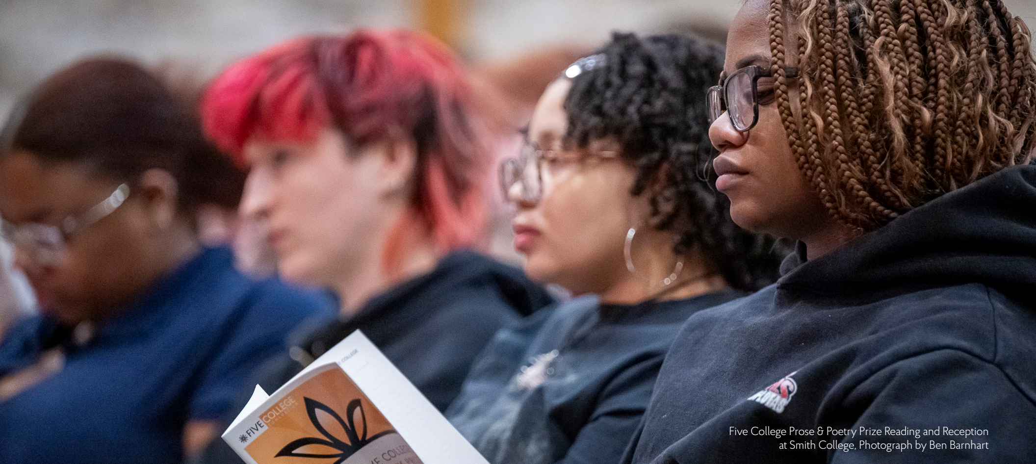
Five College Prose & Poetry Prize Reading and Reception at Smith College