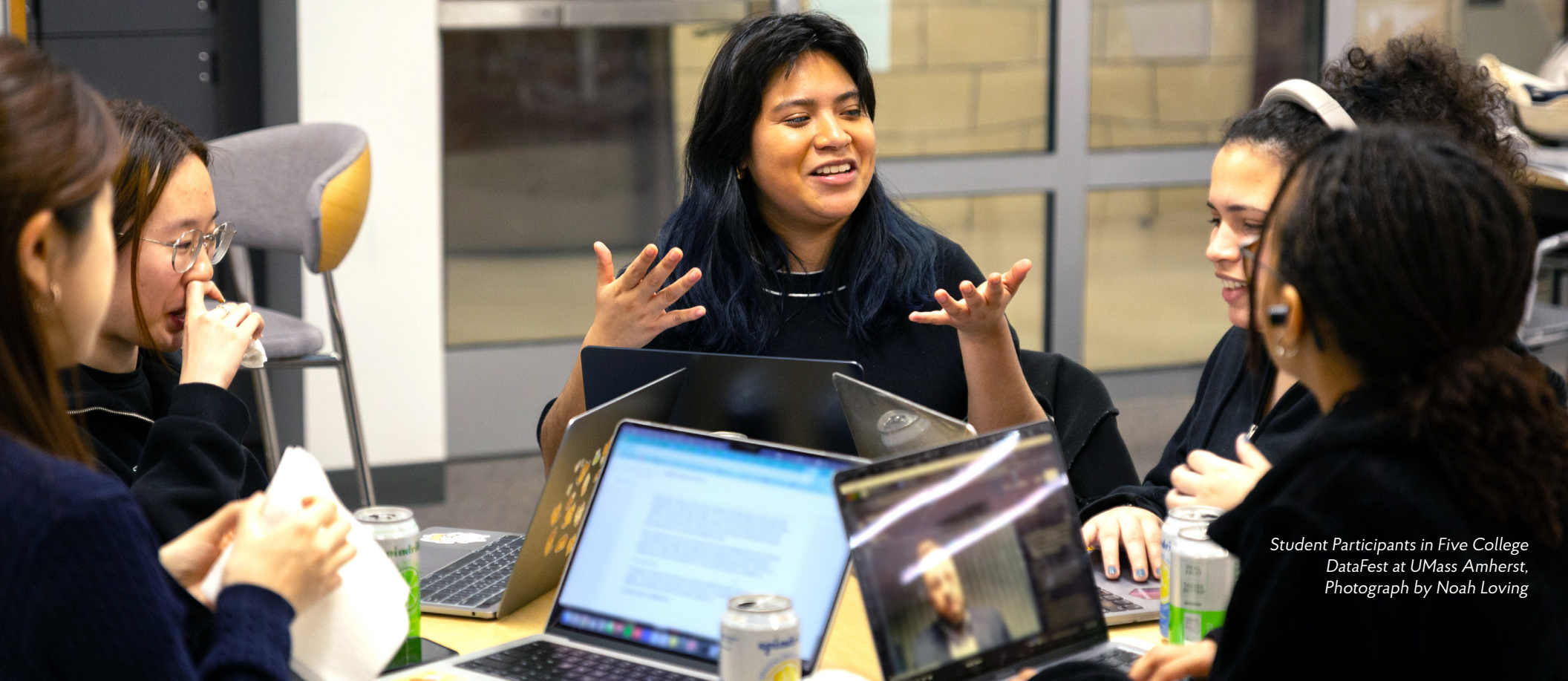
Student Participants in Five College DataFest at UMass Amherst